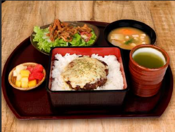
Wagyu Beef Hamburg Jyu 和牛ハンバーグ御膳 wagyu beef hamburger, rice

includes salmon skin salad, rice, miso soup, fruit, tea