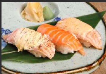
Salmon Trio サーモン三昧 assorted salmon nigiri 340