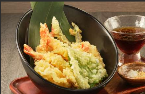
Assorted Tempura 720 天ぷら盛合せ mixed tempura served with tempura sauce