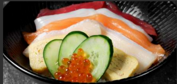
Chirashi Don 790 ちらし丼 seasonal sashimi, sushi rice