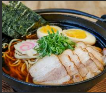
Pork Chashu Ramen 520 チャーシュー麺 ramen with pork chashu