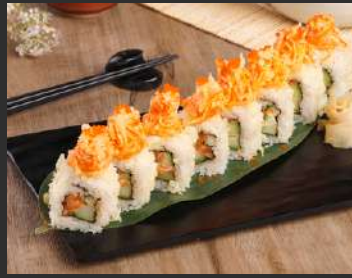
Crispy Spicy Salmon Roll 500 クリスピースパイシーサーモンロール spicy salmon, cucumber, kanikama, shrimp roe