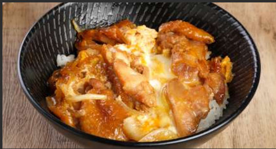
Chicken Oyako Don チキン親子丼 chicken and egg, rice