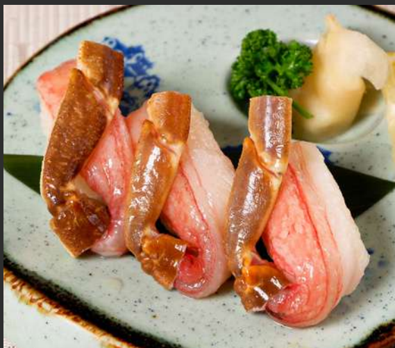
Premium Snow Crab Nigiri ズワイガニ握り