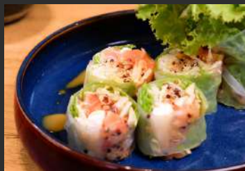
Quinoa Spring Roll 380 キノア生春巻き lettuce, quinoa, cream cheese, salmon, apple