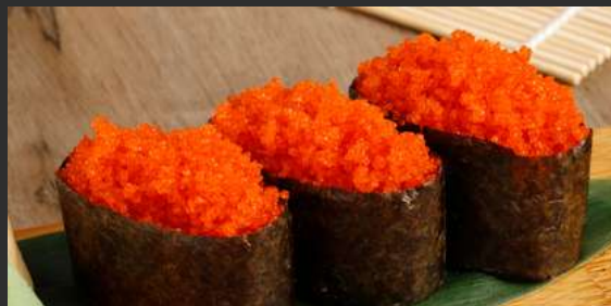
Shrimp Roe Gunkan 390 えびっこ軍艦 shrimp roe in a thin strip of nori