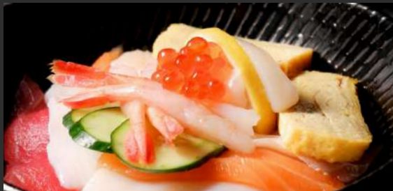
Premium Chirashi Don 890 プレミアムちらし丼 premium sashimi, sushi rice