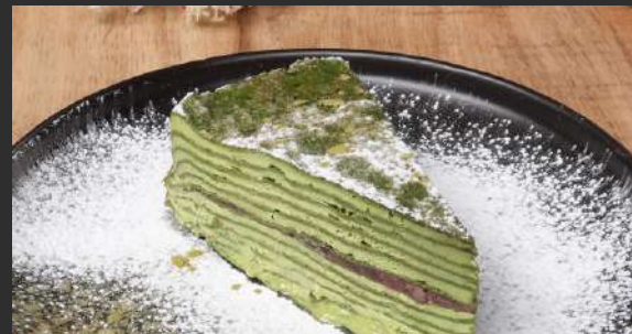
Matcha Mille Crepe 抹茶ミルクレープ