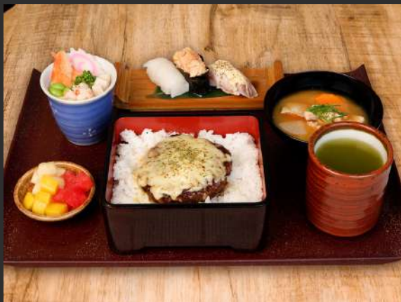
Wagyu Beef Hamburg Jyu 和牛ハンバーグ御膳 wagyu beef hamburger, rice

includes sen-ryo chawanmushi, rice, miso soup, assorted nigiri, fruit, tea