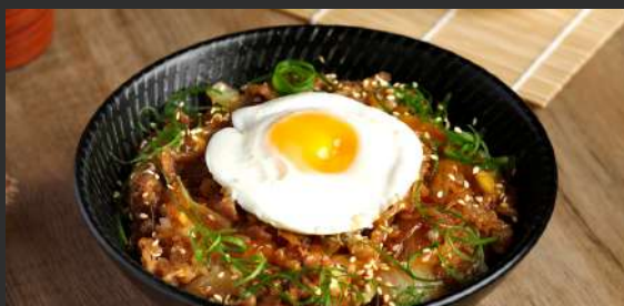
Gyu Don 400 牛丼 sauteed beef, rice