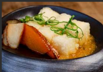
sen-ryo Agedashi Tofu 260 千両揚げ出し豆腐 traditional tofu served in a flavorful special sauce