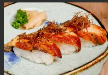
Unagi Nigiri 鰻 grilled river eel