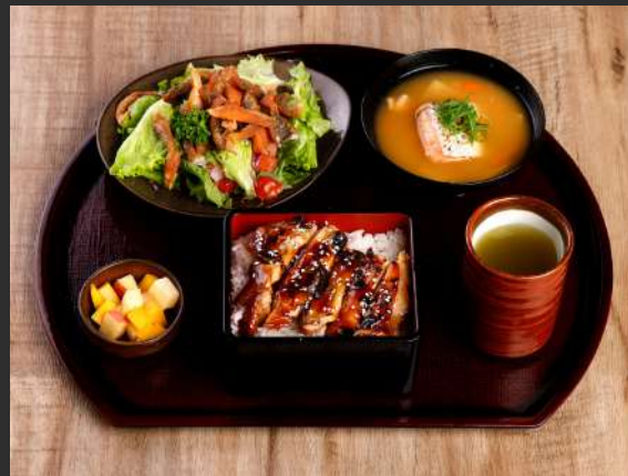
Chicken Teriyaki Jyu チキン照り焼き御膳 chicken teriyaki, rice