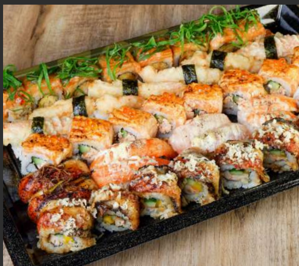
Premium Family Platter 3400 プレミアム ファミリー プラッター

30 pcs assorted nigiri • maguro nigiri, salmon nigiri, ama ebi nigiri, hotate nigiri, shrimp nigiri, ika nigiri