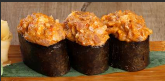
Spicy Maguro Gunkan 370 スパイシーまぐろ軍艦 spicy tuna in a thin strip of nori