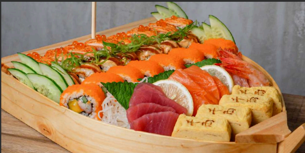
sen-ryo Sushi Boat Platter 2500 千両寿司ボート Assorted sushi served in a Japanese style sushi boat