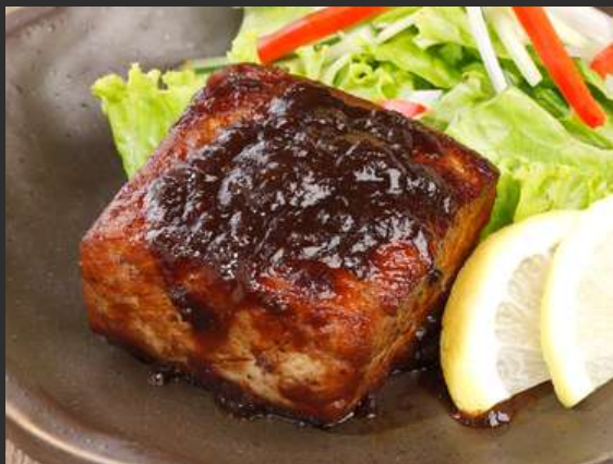
⌘ Pan-seared Maguro with Steak Sauce まぐろのステーキソース焼き grilled tuna with steak sauce