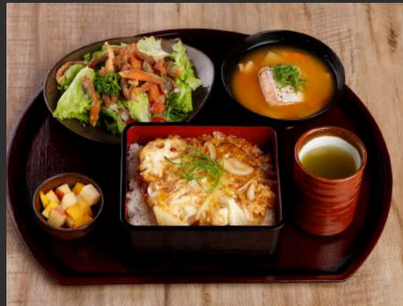
Pork Katsu Jyu ポークカツ重御膳 pork katsu and egg, rice