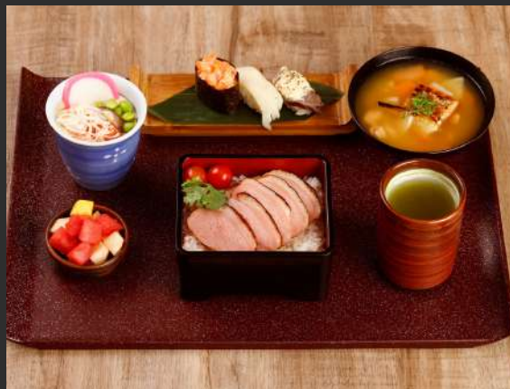
Smoked Duck Jyu 燻製鴨御膳 smoked duck, rice