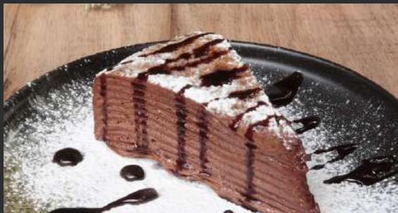
Chocolate Mille Crepe チョコレートミルクレープ