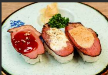
Smoked Duck Trio 260 燻製鴨三昧 assorted smoked duck nigiri