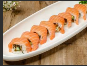
sen-ryo Roll 600 千両ロール salmon skin, salmon, cucumber