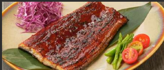
Grilled Unagi 880 鰻蒲焼き grilled river eel with special sauce