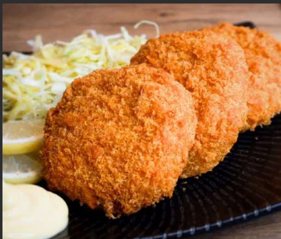
Cheese Croquette 520 チーズコロケ deep fried potato croquettes with cheese