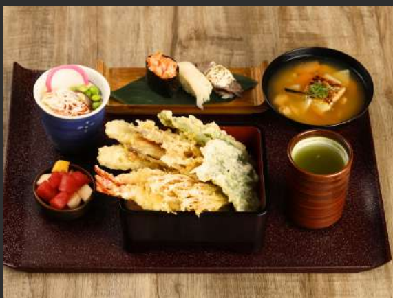
Ten Jyu 天重御膳 assorted tempura, rice