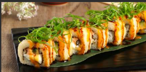
Salmon Cheese Tempura Roll 450 サーモンチーズ天ぷらロール fried salmon cheese roll