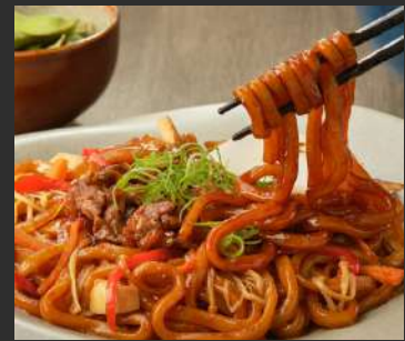
Wagyu Beef Yakiudon 1050 和牛焼きうどん stir-fried udon with wagyu beef