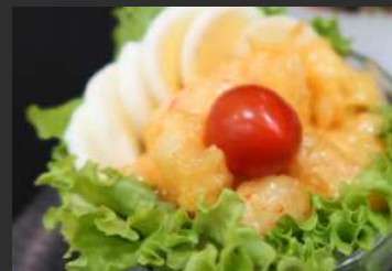
Popcorn Shrimp 650 ポップコーンシュリンプ popcorn style shrimp in special dressing