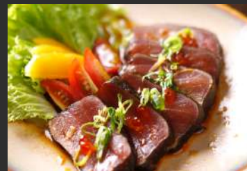
🍴 Maguro Carpaccio 700 まぐろのカルパッチョ lightly seared tuna wrapped in nori and served with citrus sauce