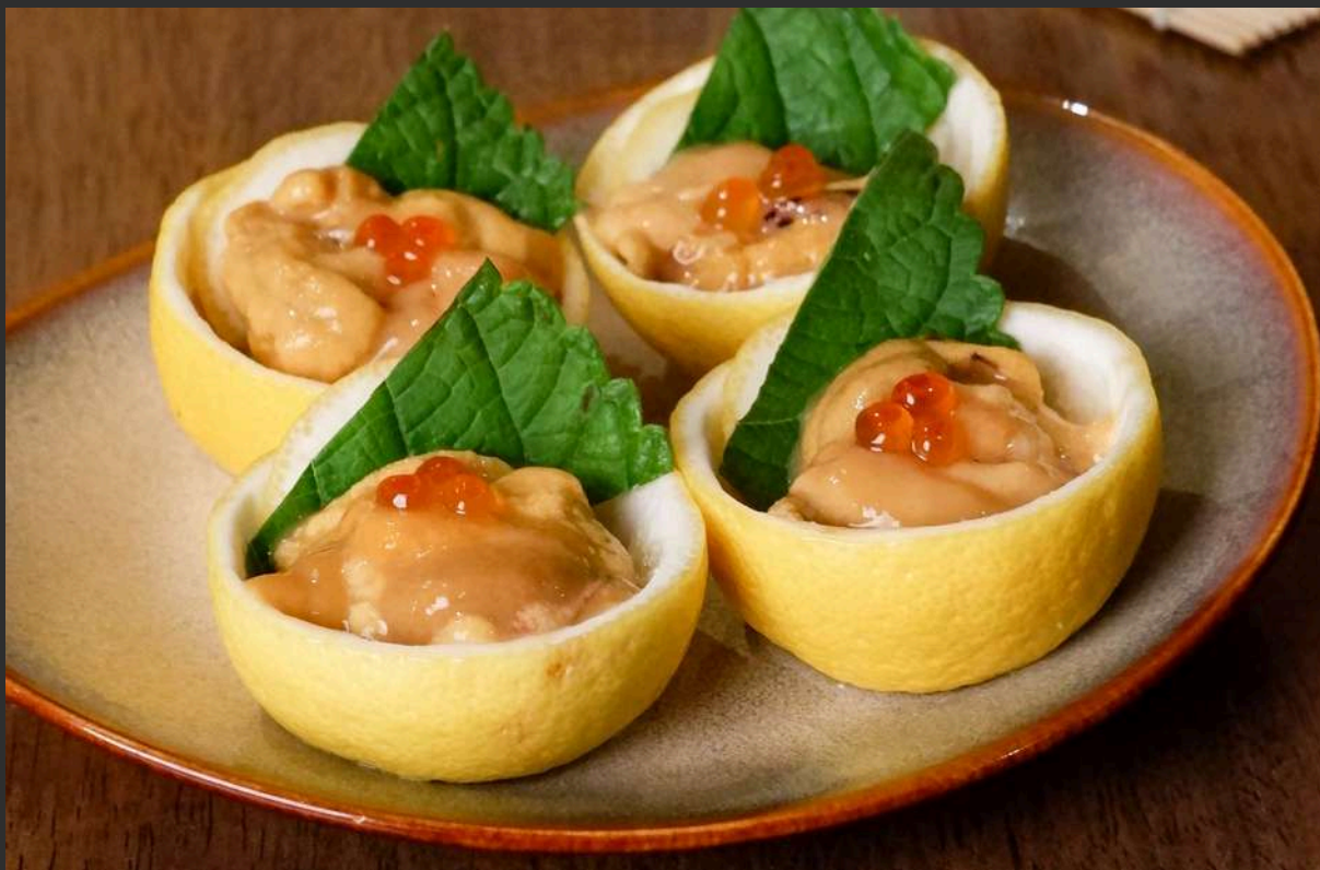
Uni Sashimi 雲丹