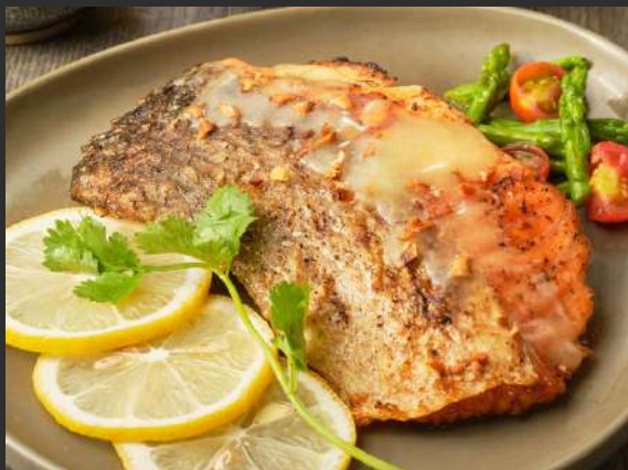
Pan-seared Garlic Butter Salmon サーモンのガーリックバター焼き grilled salmon with garlic butter sauce