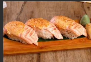
㊦ Seared Salmon with Pollock Roe Nigiri サーモン明太炙り seared salmon with pollock roe and mayo 340