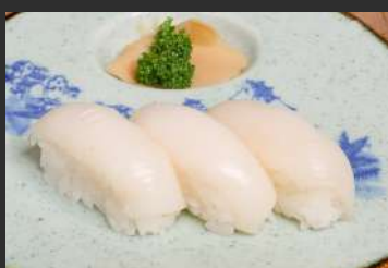
Ika Nigiri いか squid