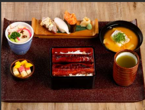
Una Jyu 鰻重御膳 unagi, rice