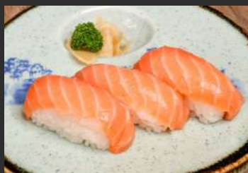
Salmon Nigiri サーモン Norwegian fresh salmon