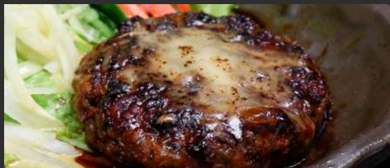
Wagyu Hamburg Steak 650 和牛ハンバーグ wagyu hamburg with melted cheese