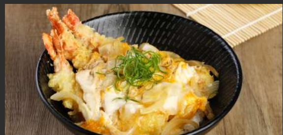
Ebi Tempura Don 440 えび天丼 shrimp tempura, rice