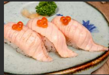
Seared Salmon Supreme Nigiri 極上とろサーモン炙り seared salmon topped with salmon roe 340