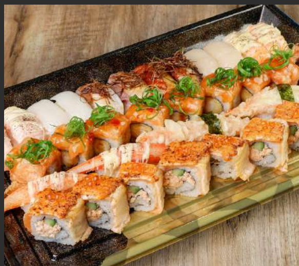
Deluxe Family Platter 3000 デラックス ファミリー プラッター

40 pcs assorted sushi • golden dragon roll, spicy double salmon roll, shogun roll, seared hamachi with steak sauce nigiri, unagi nigiri, seared kanikama with black pepper nigiri, seared salmon with black pepper nigiri, seared shrimp with black pepper nigiri, tempura shrimp nigiri, tempura kanikama nigiri