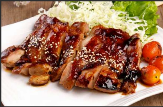
Chicken Teriyaki 680 チキン照り焼き grilled chicken with teriyaki sauce