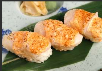
㊦ Seared Hotate with Pollock Roe Nigiri ほたて明太炙り seared Hokkaido scallop with pollock roe and mayo 440