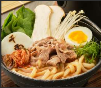
🍴 Wagyu Beef and Kimuchi Udon 950 和牛キムチうどん udon with wagyu beef and kimuchi