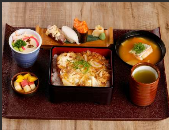
Pork Katsu Jyu ポークカツ重御膳 pork katsu and egg, rice