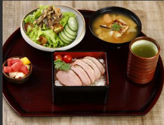
Smoked Duck Jyu 燻製鴨御膳 smoked duck, rice