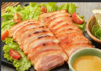
Smoked Duck 670 燻製鴨(单品) smoked duck