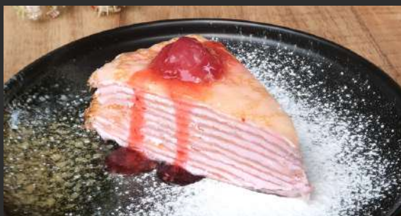
Strawberry Mille Crepe ストロベリーミルクレープ