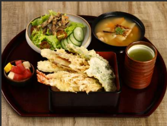
Ten Jyu 天重御膳 assorted tempura, rice