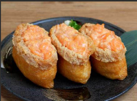
Spicy Salmon Inari 450 スパイシーサーモンいなり fried tofu skin with spicy salmon