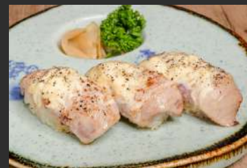
Seared Maguro with Cheese Nigiri まぐろチーズ炙り seared tuna with cheese 340