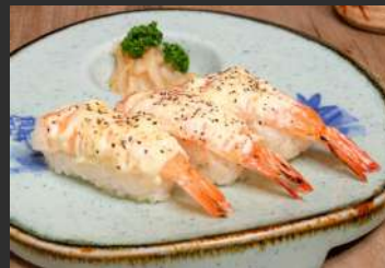
Seared Shrimp with Black Pepper Nigiri えびブラックペッパー炙り seared shrimp with black pepper and mayo 340