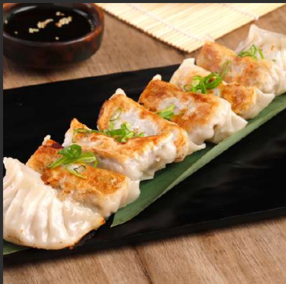
Gyoza 餃子 pork gyoza