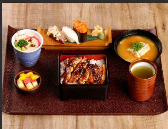
Chicken Teriyaki Jyu チキン照り焼き御膳 chicken teriyaki, rice