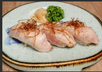
Seared Maguro Nigiri まぐろ炙り seared tuna 340 ㊦