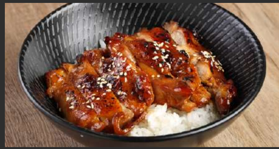
Chicken Teriyaki Don チキン照り焼き丼 grilled chicken in teriyaki sauce, rice