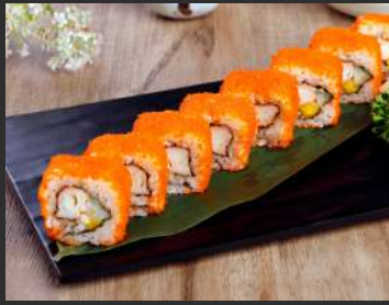
California Roll 450 カリフォルニアロール kanikama, ripe mango, cucumber, shrimp roe