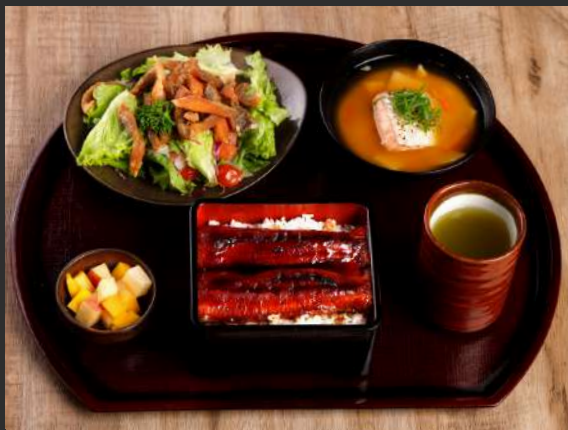
Una Jyu 鰻重御膳 unagi, rice