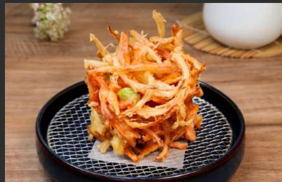
Seafood Kakiage 390 海鮮かき揚げ shrimp, squid, edamame, pumpkin, carrot, onion