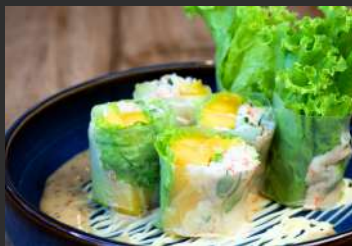
sen-ryo Spring Roll 300 千両生春巻 mango, kanikama, lettuce, wrapped in fresh rice paper, special sauce