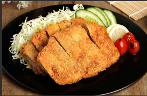
Pork Tonkatsu 720 とんかつ deep fried pork cutlet