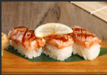
Seared Salmon Belly with Teriyaki Nigiri とろサーモン照り焼きソース炙り seared salmon belly with teriyaki sauce 340