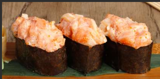
Spicy Salmon Gunkan 370 スパイシーサーモン軍艦 spicy salmon in a thin strip of nori