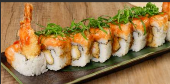
㊦ Shogun Roll 540 将軍ロール shrimp cutlet roll with spicy salmon