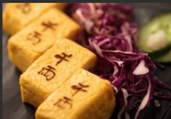
sen-ryo Omelette 290 千両厚焼き玉子 traditional Japanese folded egg