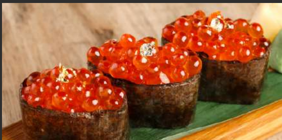
㊦ Salmon Roe Gunkan 650 いくら軍艦 salmon roe in a thin strip of nori