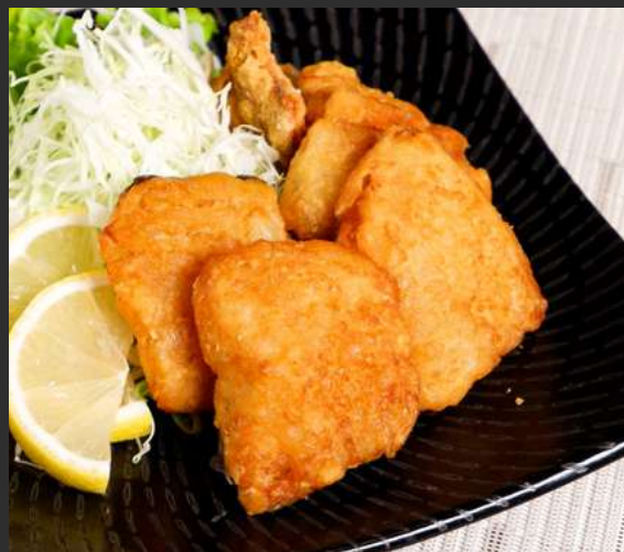
Fried Hokkaido Cod 北海道産タラの唐揚げ