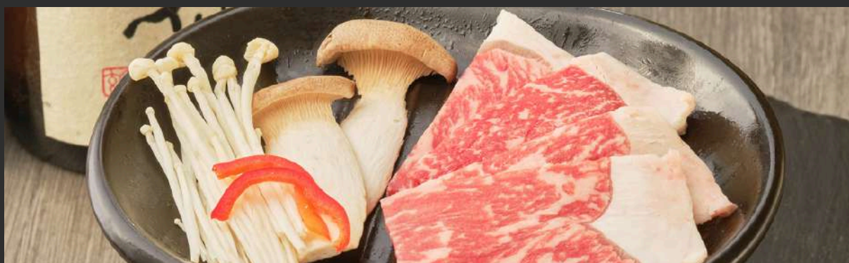
¥ Grilled Wagyu Beef 1050 和牛ステーキ grilled wagyu beef striploin