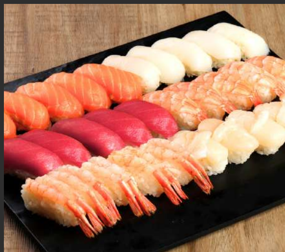
Fresh Platter 2000 フレッシュ プラッター

36 pcs assorted sushi • spicy salmon gunkan, spicy maguro gunkan, salmon cheese tempura roll, california roll, maguro nigiri, ika nigiri, salmon nigiri, hamachi nigiri, tamago nigiri