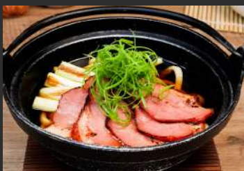
¥ Kamo Negi Udon 490 鴨ねぎうどん smoked duck udon