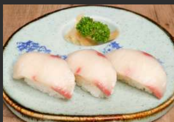
🍣 Hamachi Nigiri はまち yellowtail