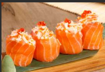
🍣 Hana Kani Sushi 花かに寿司 salmon nigiri topped with kani and salmon roe