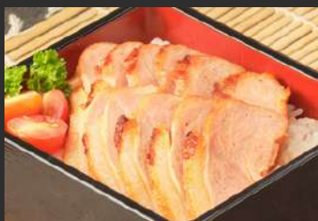
Smoked Duck Donburi 390 燻製鴨丼 smoked duck, rice