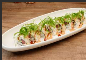
Smoked Duck Roll 380 スモークダックロール smoked duck, cucumber, cream cheese