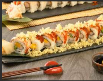
Salmon Roll 270 サーモン巻き Norwegian fresh salmon roll