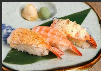
Shrimp Trio えび三昧 assorted shrimp nigiri 340