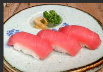
Maguro Nigiri 鮪 tuna